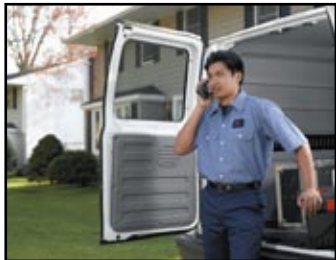
SERVICE CALL WORKS ON A VARIETY OF HANDHELDS FROM POPULAR MANUFACTURERS.

Service Call - With Service Call, technicians use handheld devices to view appointments and track services performed at customer locations without ever touching a piece of paper. They can create an invoice, capture the customer's signature, track job time, enter notes, and even collect payment information. In addition, your technicians can view a customer's history and detailed customer information, add a new customer, or schedule a new appointment. With Service Call, opportunity for error is greatly reduced, double and triple entry of information is eliminated, and productivity is significantly increased. Technicians will be able to use their handhelds to: